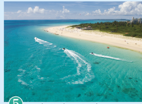
5 Yonaha Maehama Beach