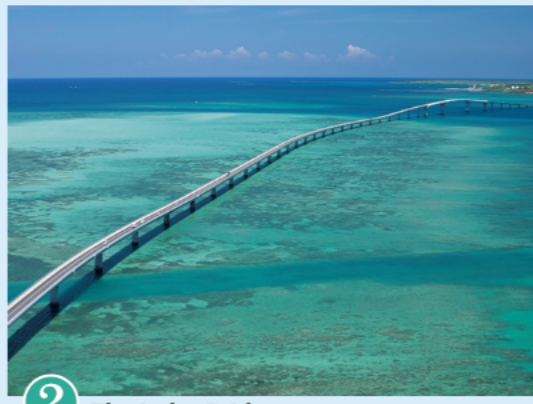
2 The Irabu Bridge