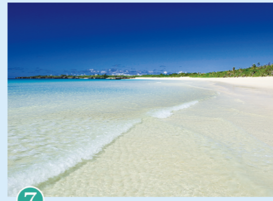
7 Toguchi-no-hama Beach