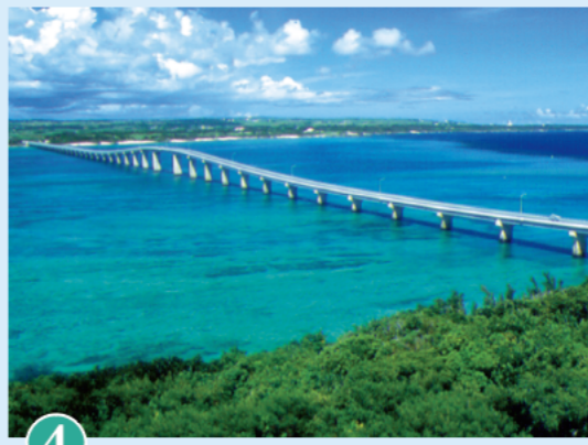
4 The Kurima Bridge