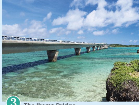
3 The Ikema Bridge