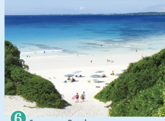
6 Sunayama Beach