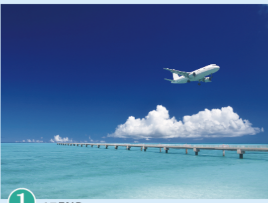
1 17END (Shimojishima Airport)